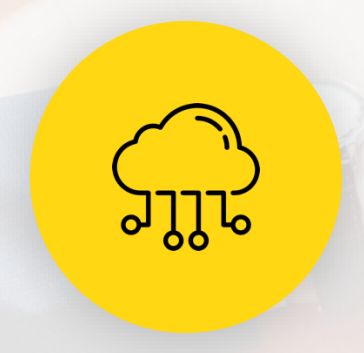
Cloud - AWS, Azure, Google Cloud